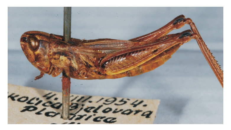
Figure 3. Stenobothrus crassipes from the BP collection. Female habitus.

Within the species of the genus Stenobothrus occurring in the Pannonian region (the Carpathian basin) St. crassipes is the most easily recognizable. All the other